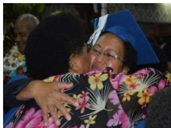
Asena Senimoli BD 2015

The BD by Extension is far more detailed and demanding but still achievable by those who do committed and determined work. Students develop vital theological competencies and critical thinking for mission and ministry in the contemporary Pacific, particularly for those who not able to attend a full-time residential theological programme.