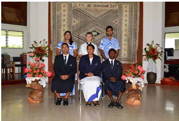
PTCEE Diploma and Certificate graduates 2017 from the Ekalesia Kelisiano Tuvalu, Methodist Church in Fiji and Rotuma and the Anglican Church of Melanesia, Solomon Islands.

We believe in SCRIPTURE, TRADITION, REASON and EXPERIENCE